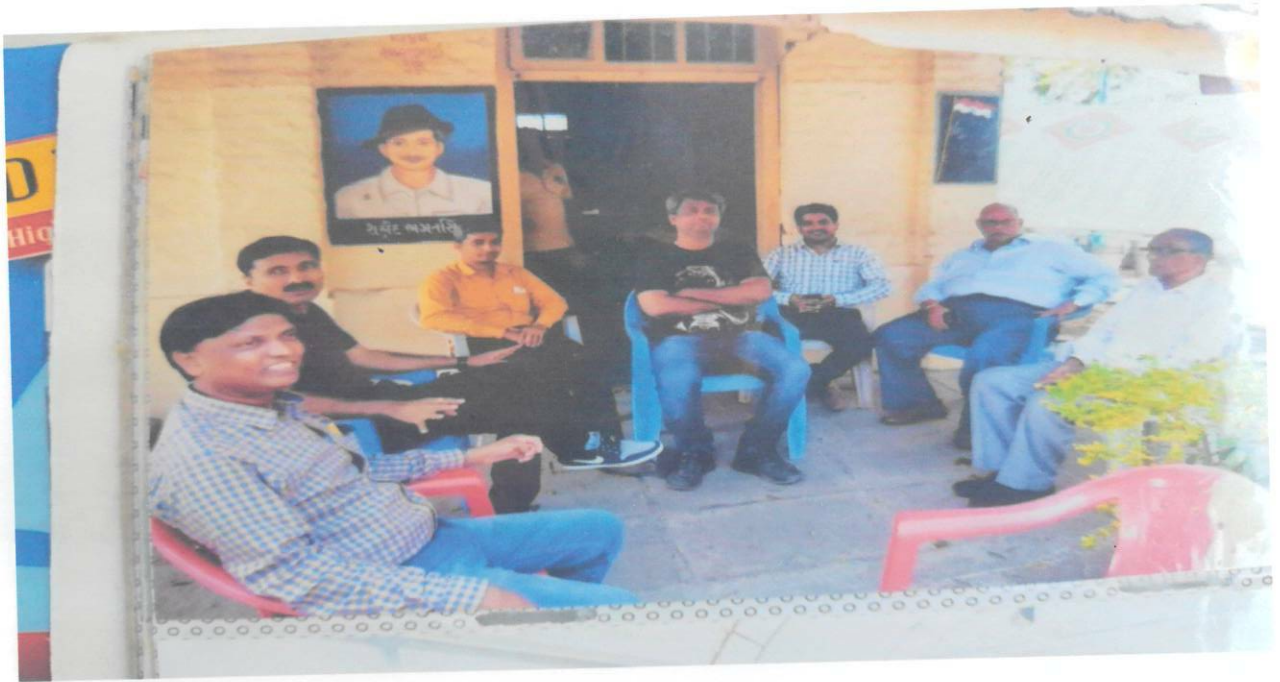
FREE DENTAL CAMP